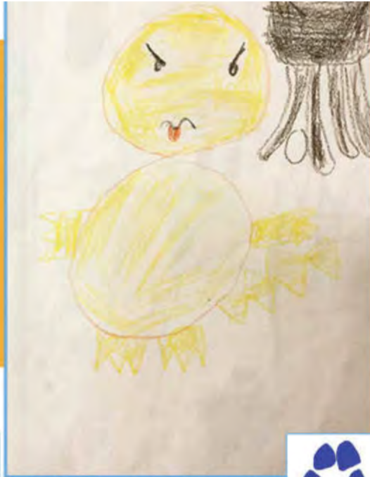
Central Park Elementary Student, David